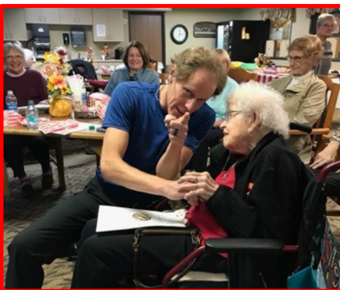
A special moment!