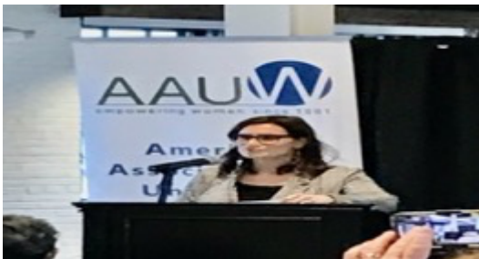
Included in the lineup of excellent speakers, was Lt. Governor Peggy Flanagan.