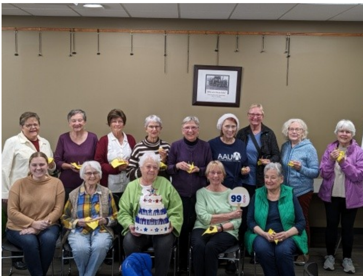
Our 99 th Birthday