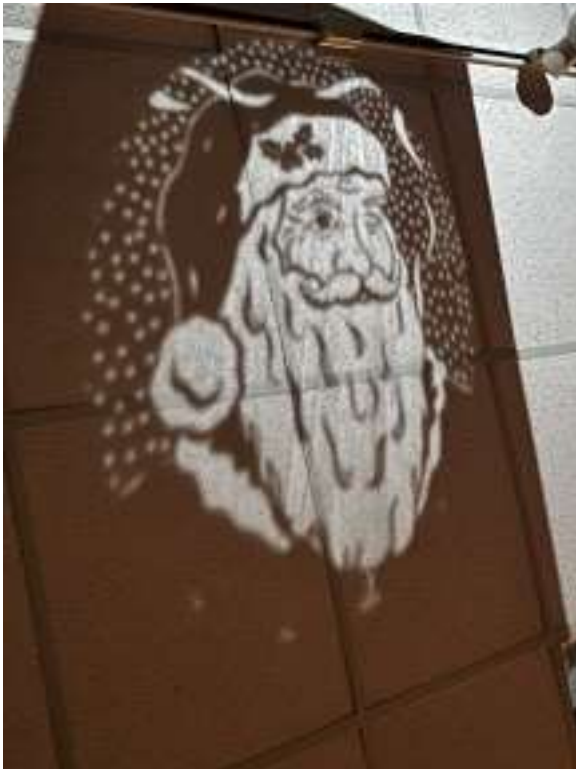
A projection onto the ceiling.